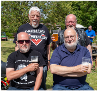
Four lads from 'The Midlands' enjoying a nice cold 'alcohol free' beer. Started coming 20 years ago - cheers lads.