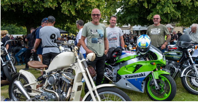
The boys from Minster Lovell, "Never missed a 'Bike Night' in the past 10 years". "Here's to the next decade".