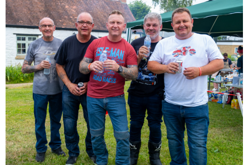
The crew from Coventry have been coming for over 15 years. "Well done lads".