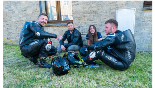
Another friendly group from Wantage, with 15-20 years under their belts.