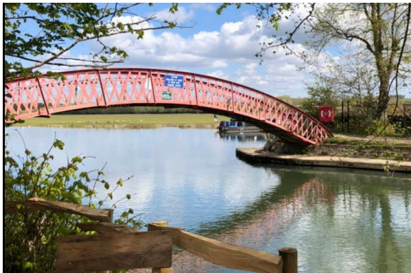
Bridge Picture from The Medley Facebook page.

Keep going for approximately 2 miles past the marina and there you will find a bridge to cross. Once crossed turn right and stay on the path to the next bridge, cross the river and turn left for refreshment in the Medley. (Pizza, drinks, licensed bar open spring and summer).