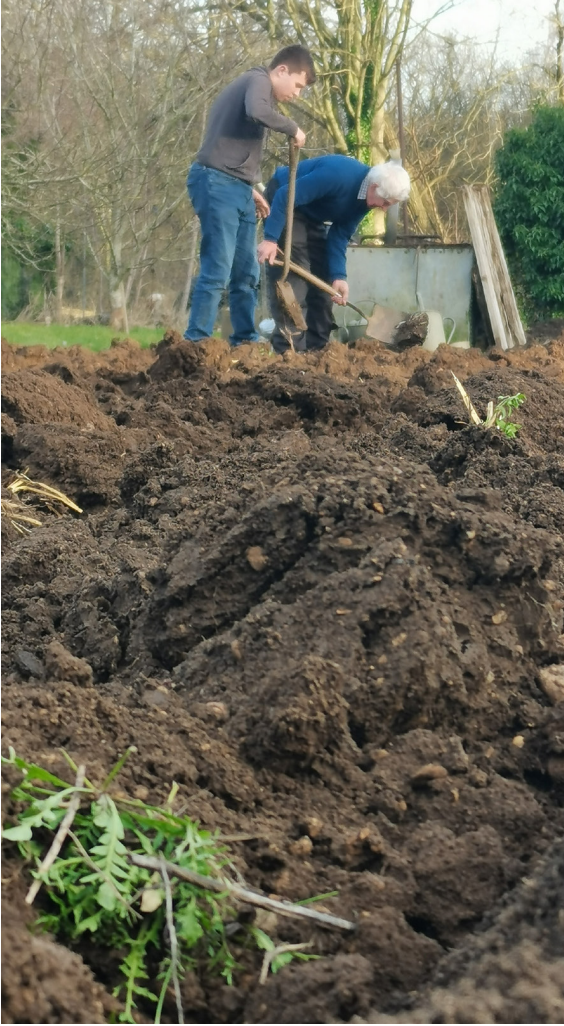
Ready for the potatoes (by Abi Want, age 13)

The quality was particularly high in the under 16 section of this month's Photo Competition and the judges were split on the decision for the winner. They were impressed with the unusual composition of Abi's picture 'Ready for the Potatoes', and with the quality of the light in Oliver's 'Stacking Granny's Woodpile'.