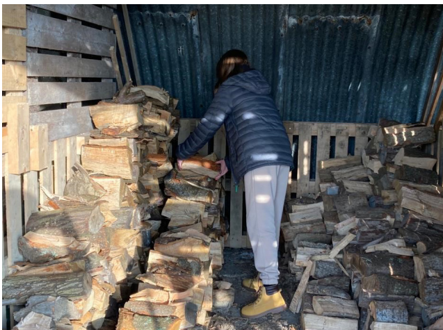
Stacking Granny's Woodpile

As there was no winner last month, the judges took the easy way out and have awarded them both joint winners! Each will be receiving a gift voucher for £15 courtesy of P Bruno Car Repairs.