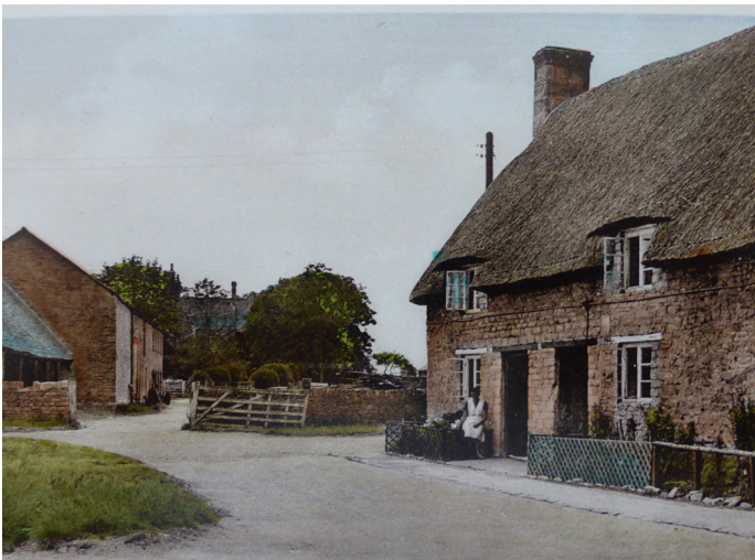
Cassington around 1930-40. Can you spot where it is?

Sports Day on the playing fields or Green Beer festival at the Red Lion Summer event at Churchfields